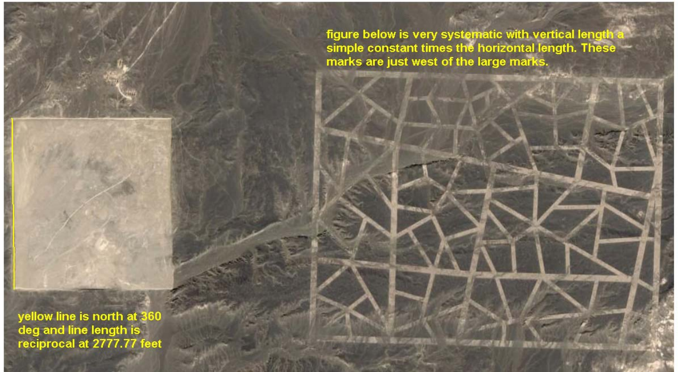
figure below is very systematic with vertical length a simple constant times the horizontal length. These marks are just west of the large marks.

yellow line is north at 360 deg and line length is reciprocal at 2777.77 feet